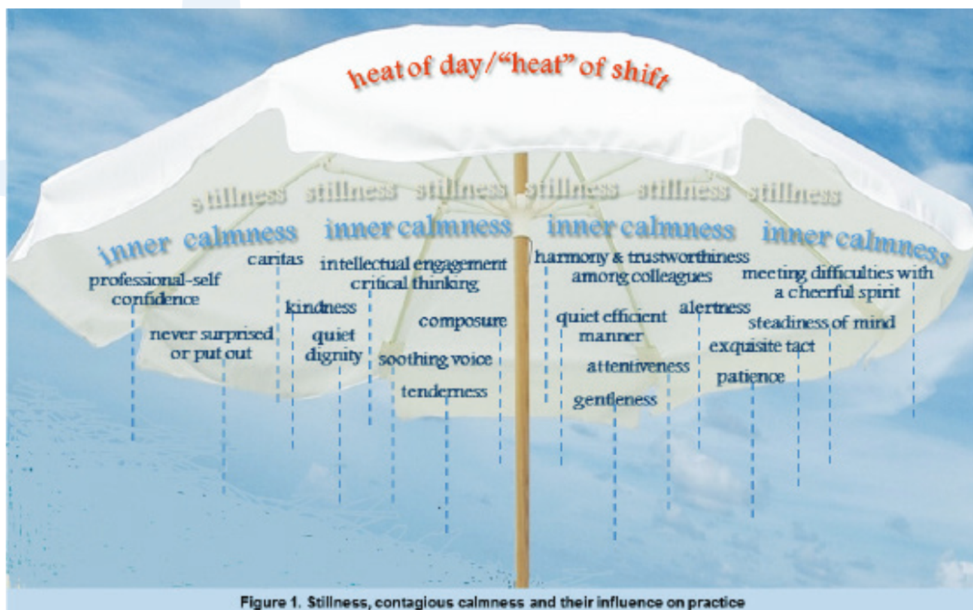
Figure 1. Stillness, contagious calmness and their influence on practice

stillness. Contagious calmness is most influentially operationalized in the therapeutic milieu dimension of Careful Nursing. At the same time, it is a practice principle that influences all the dimensions and concepts of Careful Nursing practice. It serves to protect nurses from the stress, pressures, and tensions; the “heat” of many practice settings, which can lead to burnout. It also deepens nurses’ capacity to engage in healing nurse-patient relationships and to relate in sensitive and harmonious ways with one another. An illustration of the influence of contagious calmness in practice is suggested in Figure 1.