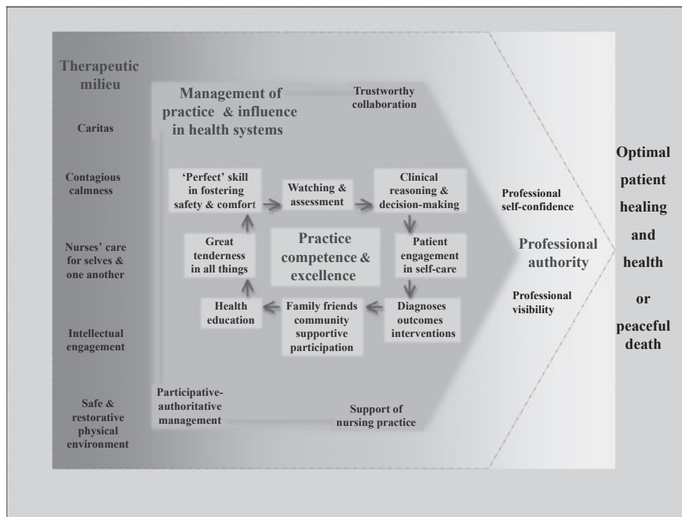
Figure 3 Careful Nursing professional practice model.

The four categories concerned with the attitudes and actions of skilled nursing as a public service were used to construct the nursing professional practice model, as shown in Fig. 3. To construct the model, the four categories were viewed as interrelated concepts, and their subcategories as interrelated dimensions of the concepts: the therapeutic milieu with five dimensions, practice competence and excellence with eight dimensions, nursing management and influence in health systems with three dimensions and professional authority with two dimensions. The names and definitions of the concepts and dimensions were derived from the historical data