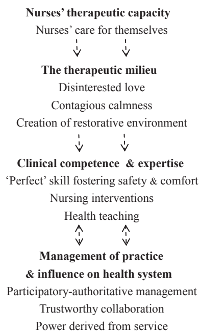
Figure 1 Careful Nursing as a conceptual model.

The structure and utility of the model was assessed and critically analysed by nurses in education and practice in Ireland (Meehan 2006, McMullin et al. 2009) and the US